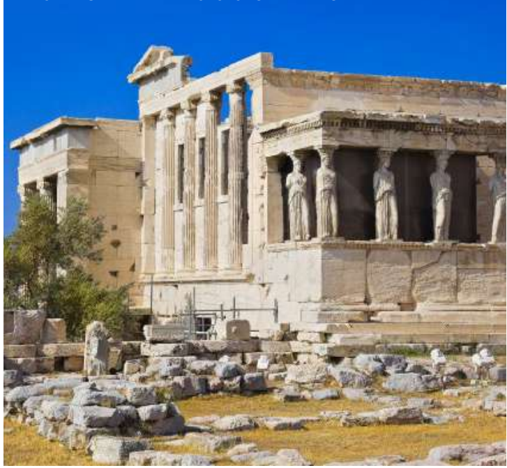
ERECHEUM TEMPLE IN ACROPOLIS AT ATHENS

After breakfast, transfer to Athens airport for your return flight home.