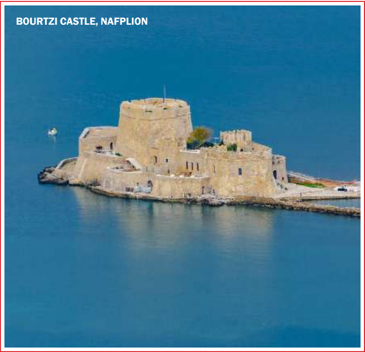
BOURTZI CASTLE, NAFPLION